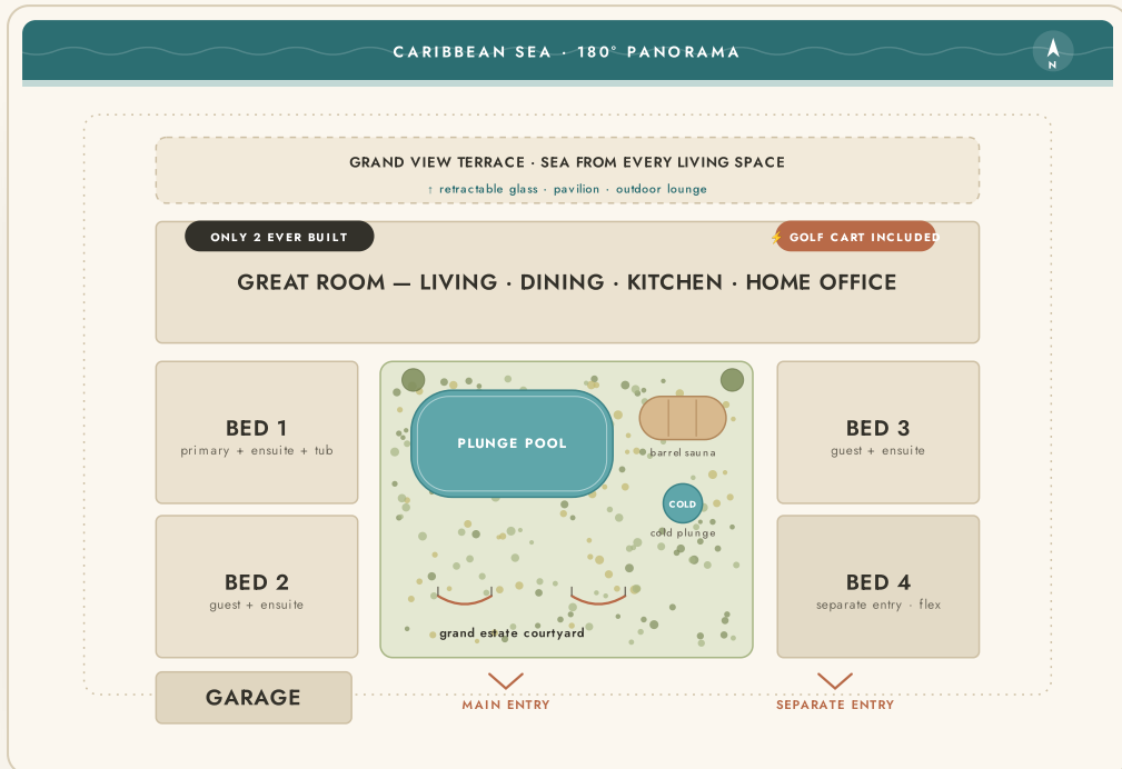
Concept layout — not to scale · ↑ north / Caribbean Sea view at top