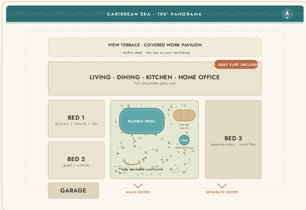
Concept layout — not to scale · ↑ north / Caribbean Sea view at top