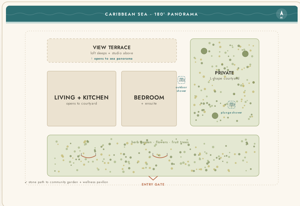
Concept layout — not to scale · ↑ north / Caribbean Sea view at top